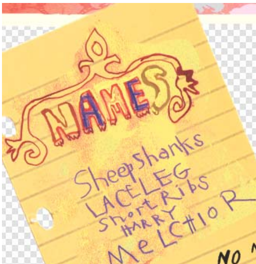
Figure 2: List of names The yellow background represents paper given to the Queen, with a list of names gathered by the animals. The letters should be legible but integrated into imagery.