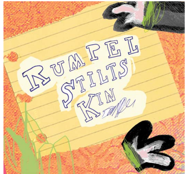
Figure 4: Rumpelstiltskin In this example I have used segmentation to encourage learners to distinguish parts of a new word or name.

In this project it is important that the lettering is legible and aids children's comprehension [18]. Visual clues used in the work need to excite readers and motivate them to decipher the text.