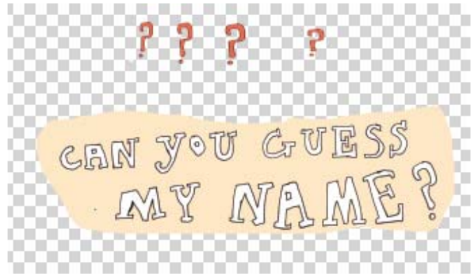
Figure 3: Guess? Asking questions throughout the narrative attempts to engage children in what is going on in an interactive way.