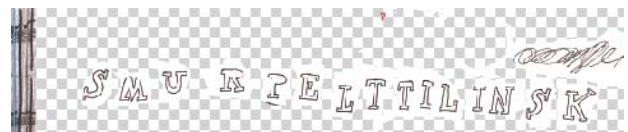
Figure 5: Cryptogram Jumbled letters of name. Readers are prompted to decode/decipher words.

In this project it is important that the lettering is legible and aids children's comprehension [18]. Visual clues used in the work need to excite readers and motivate them to decipher the text.