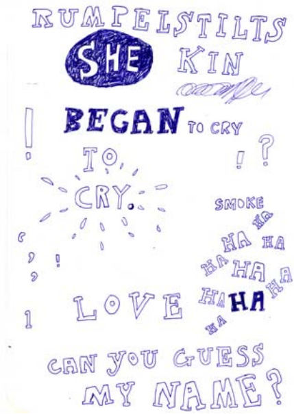
Figure 1: Sketchbook rough Biro lettering.

I am currently experimenting with lettering which is functional, visually appealing and fully integrated with the book's imagery [1].