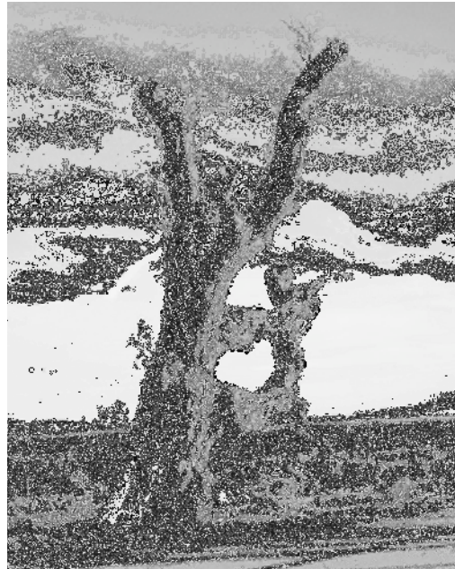
Figure 1 Koraleigh Ring Tree, 2010.