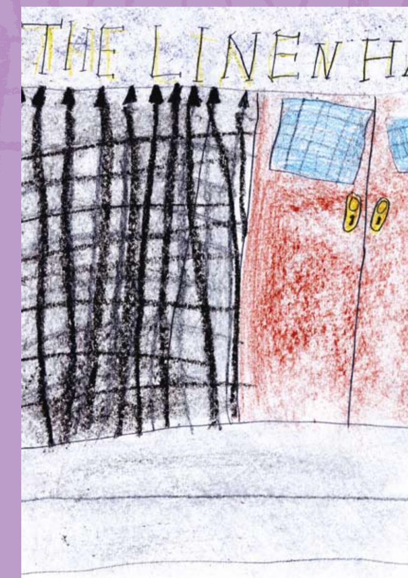
Maeve, age 9

The tour progressed through the main library space used by the public daily and into one of the adjoining rooms which houses some of the artefacts and books charting the history of the troubles.