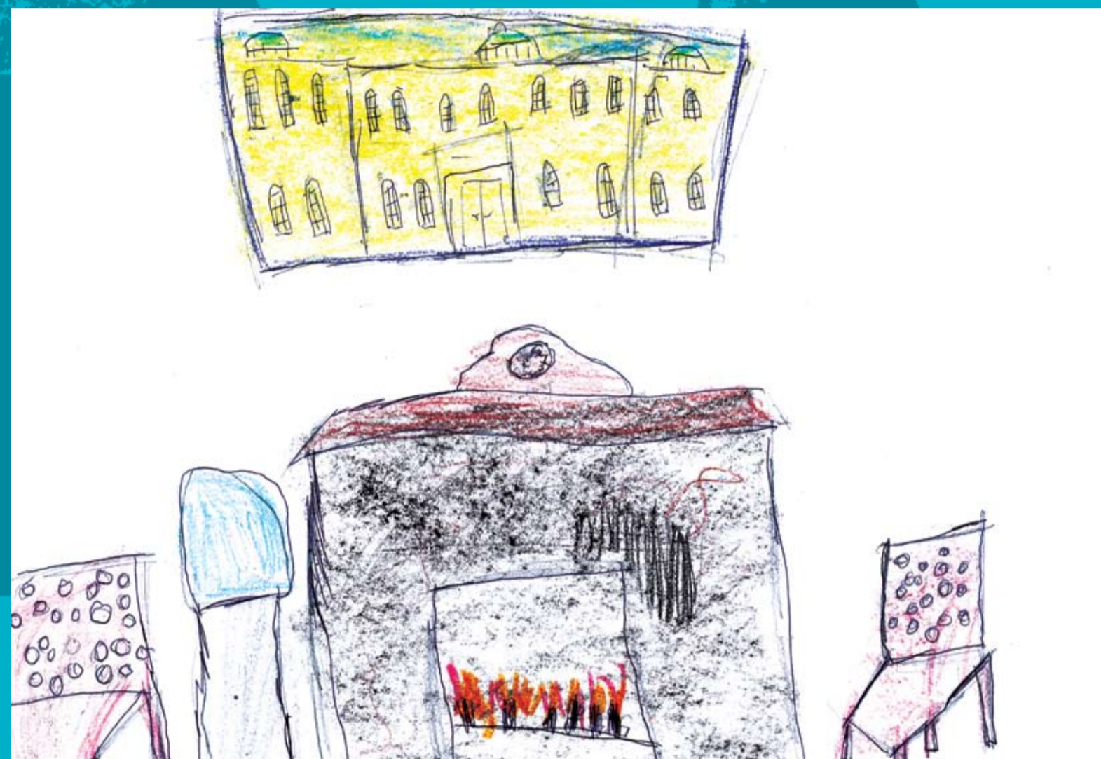
Rhian, age 7