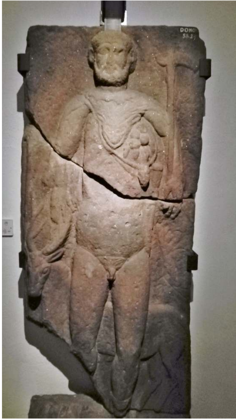
Fig. 3. The Stag God from the Donon Sanctuary (Strasbourg Museum)