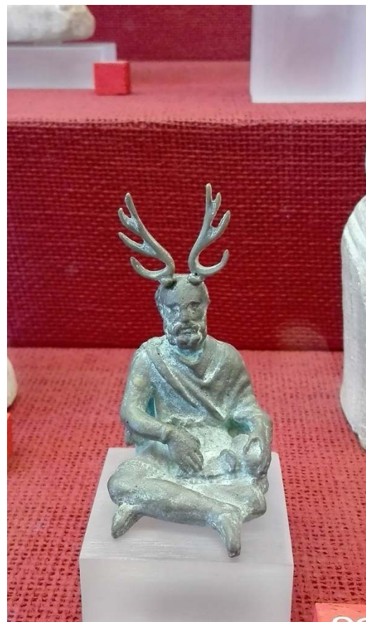
Fig. 11. Cernunnos (Mainz Roman-German Museum, no. 26, 200AD)