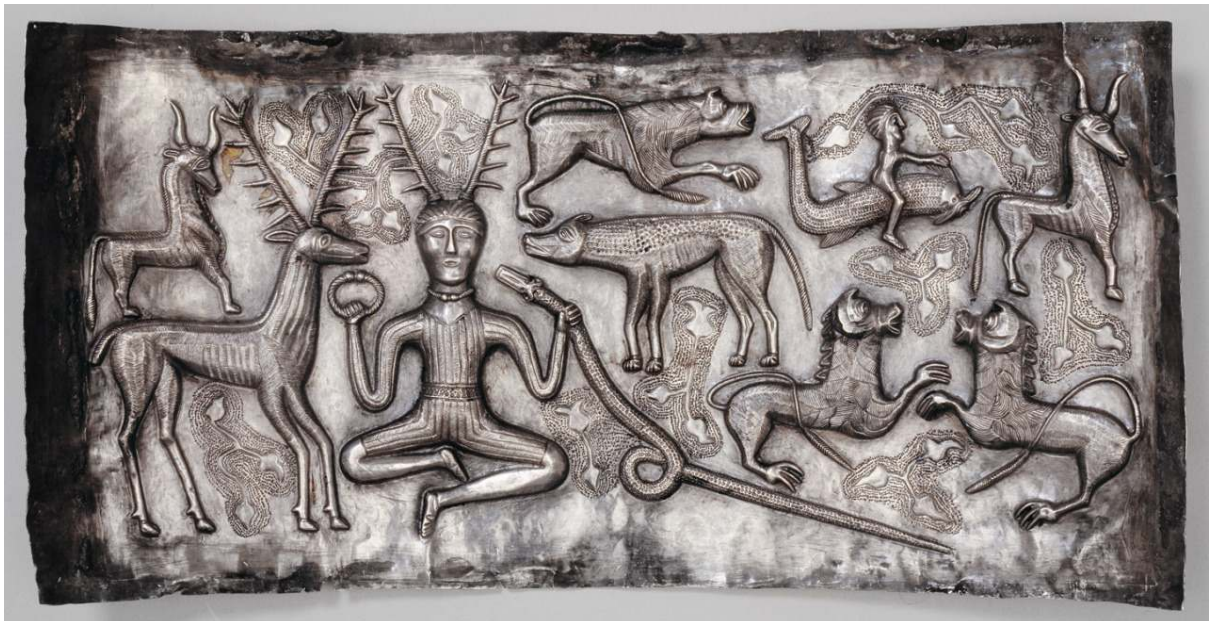
Fig. 8. Gundestrup cauldron (Denmark) – Cernunnos plate