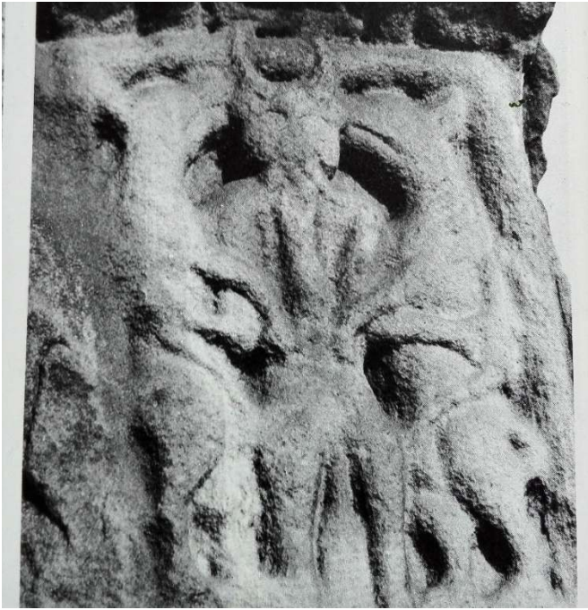
Fig. 6. The horned figure surrounded by wild animals (Market Cross, Kells)