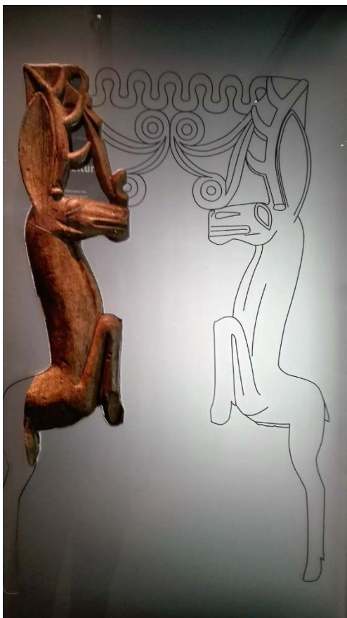
Fig. 10. The Deer-figure from Fellbach-Schmiden, inv. no. V 86.8, Stuttgart Badenwürttemberg Museum (127 BC)