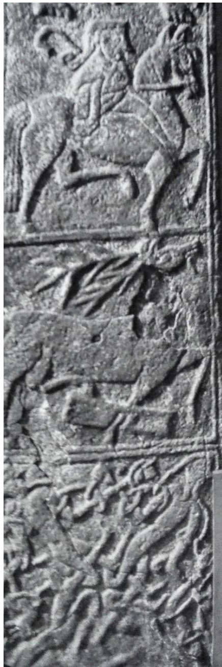
Fig. 1. Banagher cross-shaft