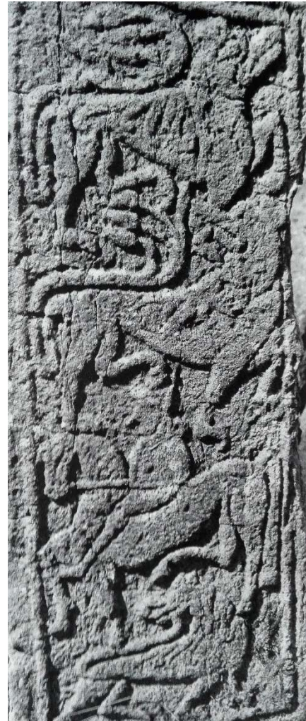
Fig. 5. The Clonmacnoise pillar (Co. Offaly)