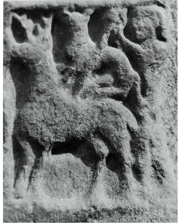
Fig. 7. The scene of the hunt (Market Cross, Kells)