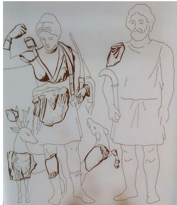
Fig. 9. Votive relief to Diana Abnoba and Silvanus from Freisenheim (Freiburg Archaeological Museum, 100 AD)