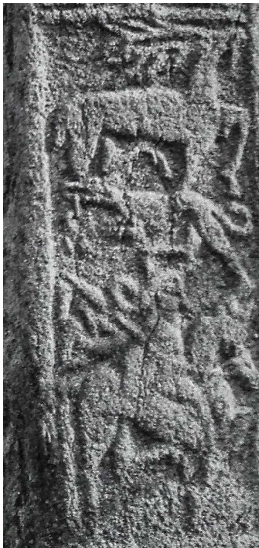
Fig. 2. Bealin Cross, north side