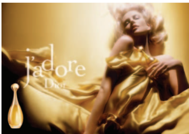
Figure 1. Charlize Theron reclining on a bed of gold. Reproduced by kind permission of Parfums Christian Dior (UK) Ltd.

The essential characteristics of the Celtic goddess Brigit is also evoked in the current advertising campaign for 'Chanel No. 5'. For many women this is the ultimate fragrance, a 'timeless classic' that is probably the best-known perfume in the world. Chanel's current TV advertising campaign features the celebrated Australian actress Nicole Kidman, widely regarded as one of the most elegant and graceful actresses on the Hollywood 'A' list (see Fig. 2). It is no surprise, therefore, that Kidman embodies the essence of 'Chanel No. 5', a fragrance that describes itself as 'entrancing and elegant'. After all, Nicole Kidman sets 'a unique standard of elegance'. This scent conjures Brigit's association