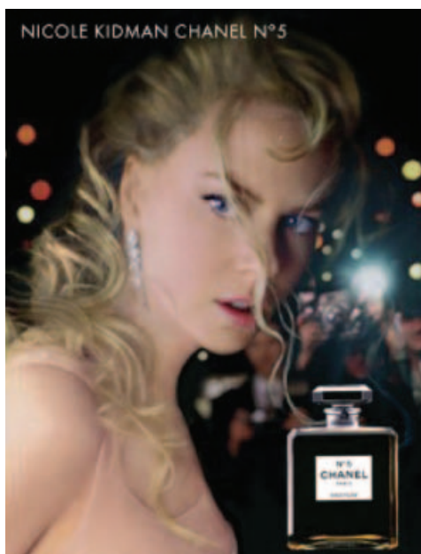
Figure 2. Kidman, as the essence of Chanel No.5. Reproduced by kind permission of Chanel (UK).

with creativity, culture and the arts. It marries Brigit's sensual associations with the cultural capital she also embodies, a true marriage of nature and culture, not unlike the actress chosen to symbolise its essence: a beautiful woman who is also an actress of the highest calibre, who has endured a marital break-up and has risen victoriously and with dignity above life's vicissitudes, with style and grace, to become one of the most acclaimed actresses of her generation.