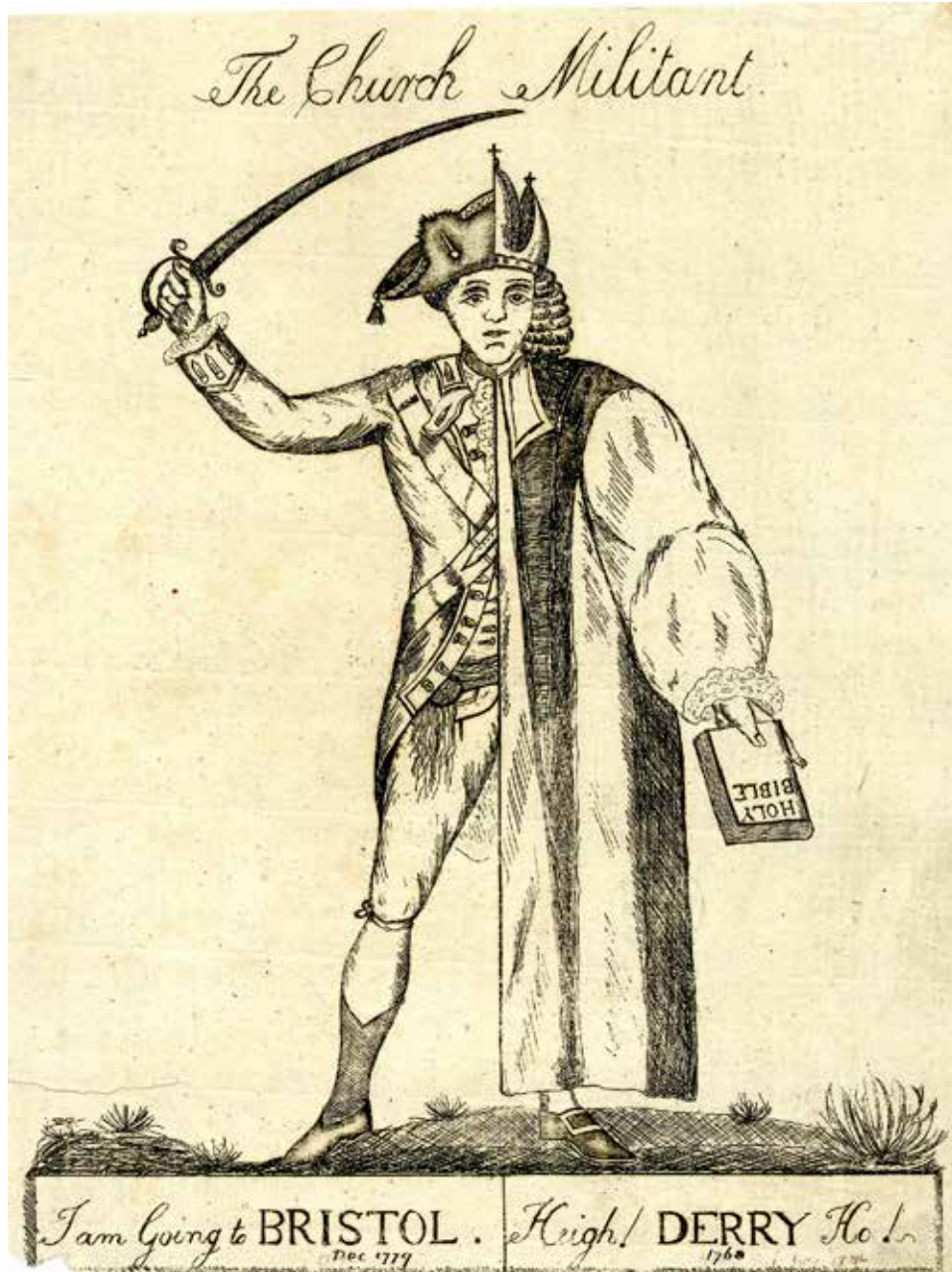
Anonymous, 'The Church Militant'. Portrait of Frederick Augustus Hervey, Bishop of Derry and 4th Earl of Bristol. Etching, 1784, British Museum.

appreciate the astonishing wonder of creation in a way that sheep and goats do not, and so by this gratitude and understanding make it more itself, or complete the equation. Hervey compares this value-added condition to the relationship between food and the human palate: 'a lively sense of warm return of the bounties of Providence brings to those