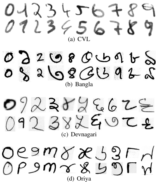
Fig. 2. Representative handwritten digits for the different databases (from zero to nine).

normalization technique. The images were preprocessed as in the original images in the MNIST database. Because some databases (e.g. Indian digits) have very noisy images and/or images in color, images were first binarized with the Otsu method at their original size [25], then their size were normalized to fit in a 20x20 pixel box while preserving their aspect ratio. The resulting images contain 8 bit gray levels due to the bicubic interpolation for resizing the images. All the images were centered in a 28x28 pixel box field by computing the center of mass of the pixels, and translating the gravity center of the image to the center of the 28x28 field. The number of classes, the total number of images in the database, and the number of images per class, for both training and the test are given in Table I.