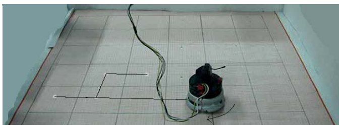
Figure 8. Clockwise rotation after 5 th time point