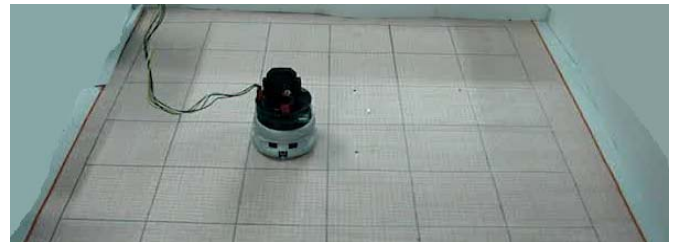
Figure 3. Initial position of the Khepera