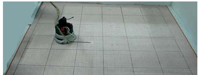
Figure 4. Motion to the left after 1 st time point