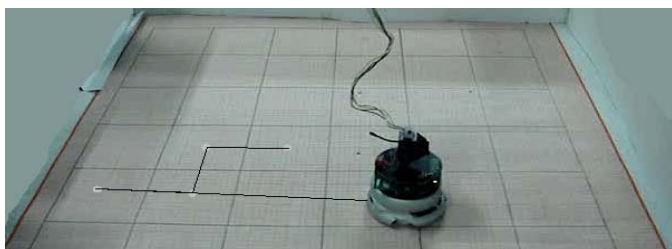
Figure 7. Backward motion after 4 th time point