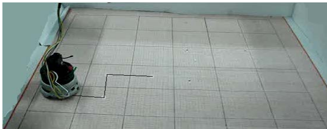
Figure 6. Motion to the right after 3 rd time point