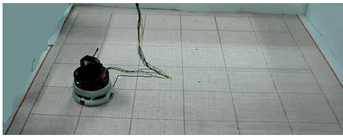
Figure 5. Motion to the left again after 2 nd time point